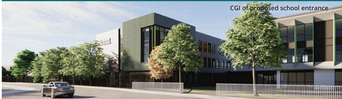
CGI of proposed school entrance

Bowmer + Kirkland (B+K) has been selected by the Department for Education (DfE) as the main contractor on plans to regenerate Greenshaw High School.