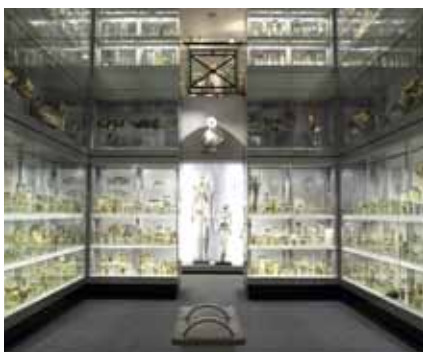
The interior of the Hunterian Museum .