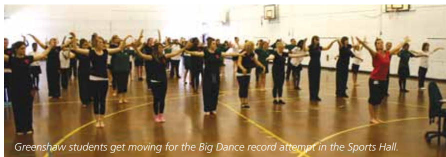
Greenshaw students get moving for the Big Dance record attempt in the Sports Hall.

The PE Department arranged dance lessons at lunchtimes and after school with extra sessions to give students plenty of opportunity to practise for the world record attempt. We are currently waiting for the results.