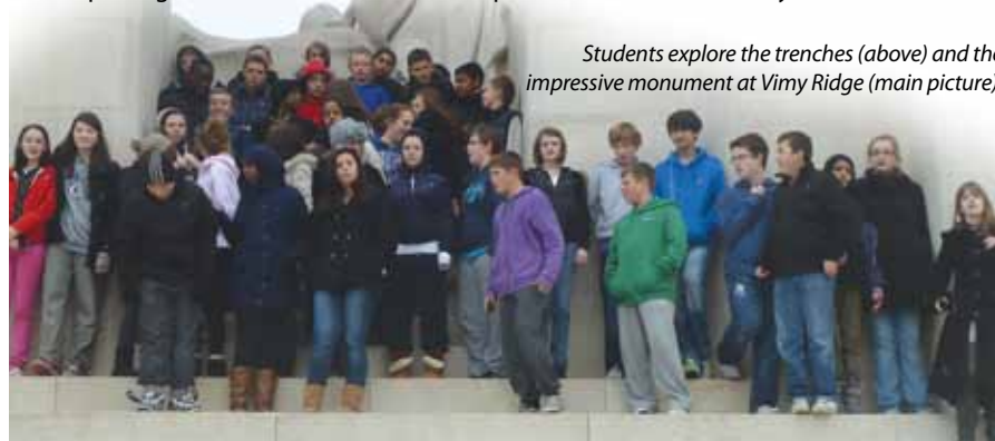
Students explore the trenches (above) and the impressive monument at Vimy Ridge (main picture).