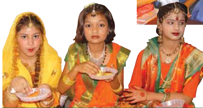
Top: students celebrate Founder's Day.