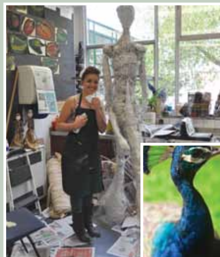
Some of the amazing artwork on show in June.

GCSE: The GCSE Art Exhibition will take place on Friday 25th June in the Art Department and vending area. Work from the current Year 11 will be on display, including their coursework and recent exam work.