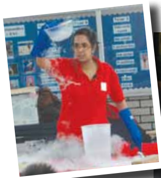
Above and left: getting hands-on in the Science presentations. Below: students get to grips with a tricky problem.

Year 7 and 8 witnessed the first of two interactive science presentations – the Supercool Show. Concepts about temperature and heat were demonstrated and students were shown what happened to the properties of different materials when they were immersed in liquid nitrogen and boiling water. Year 9 experienced the Material World Show, which demonstrated what the world around them was made of. Both presentations were very professionally staged and entertained the students whilst exploring scientific theories.