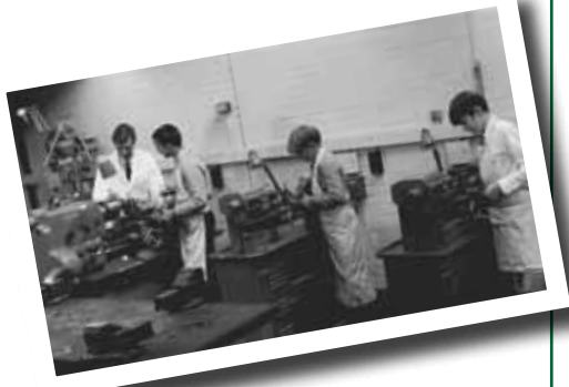
being used as classrooms.